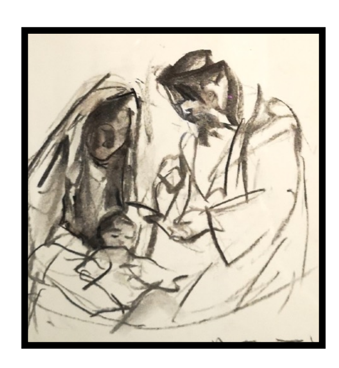
Holy Family by Marlene Lees

Misrepresenting the Church's position, e.g., "The Church opposes science," ignoring its historical support for scientific inquiry (like the Vatican Observatory).